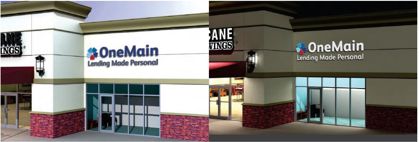
Opaque perforated blue vinyl film has the unique ability to appear blue during the day and white at night.