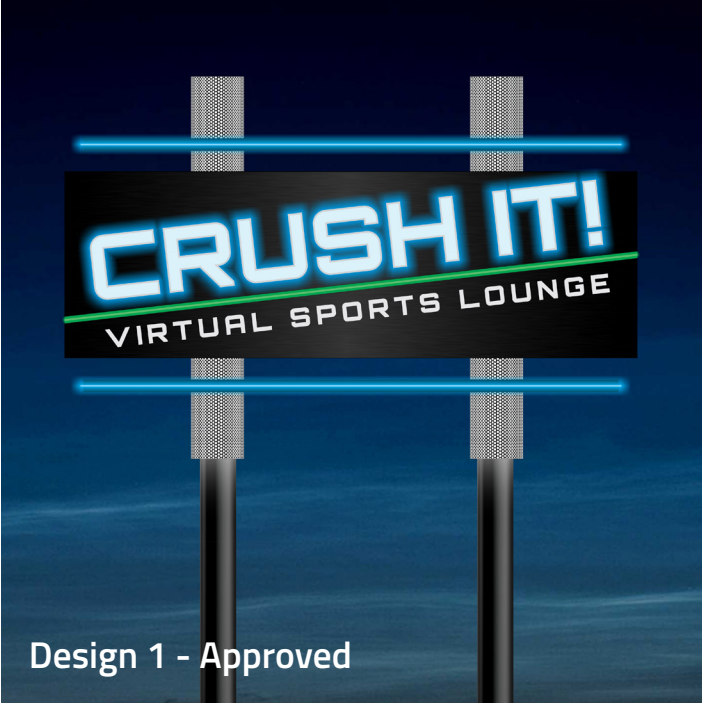
Design 1 - Approved